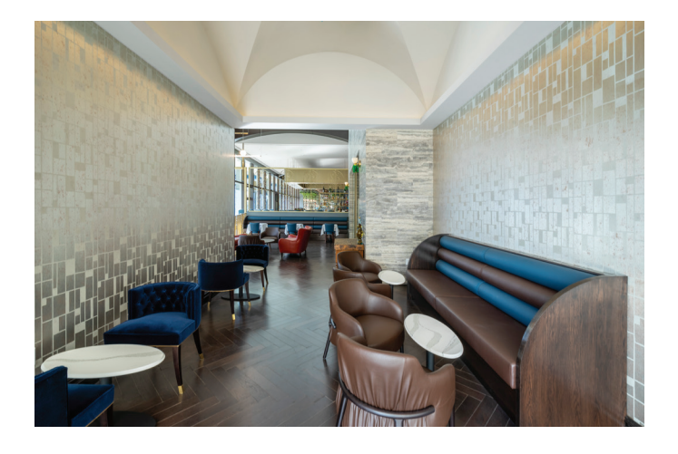
Opposite page: A mix of materials welcomes guests to Porto Leggero inside Jersey City's Harborside Financial Plaza 5.

This page: The horseshoe-shaped bar is now the restaurant's glamorous central focus, complete with fluted brass millwork; jewel tones and various seating options define the restaurant's different spaces.