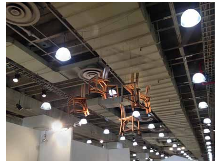
Lasercut light fixtures around ICF.