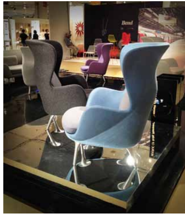
Wing chairs at Fritz Hansen.