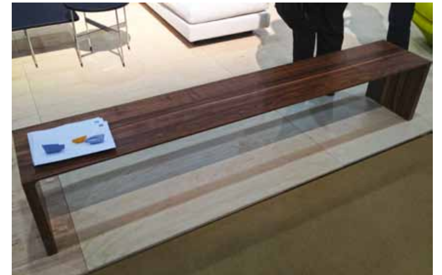
Bench by Ben Sen.