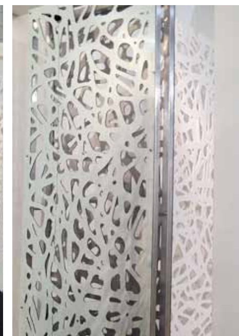
Screens by Razortooth Design