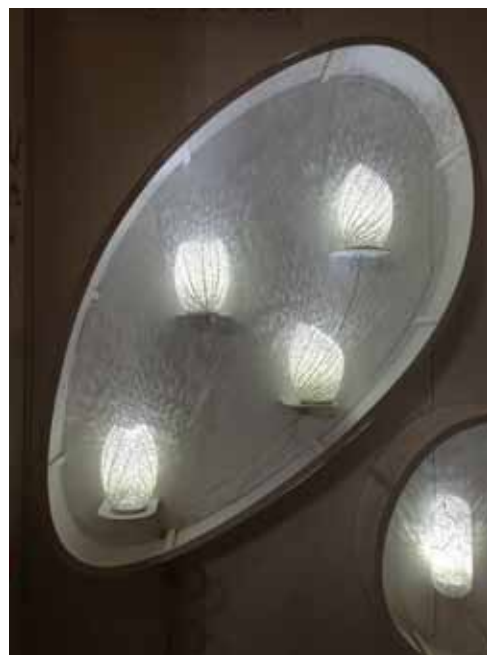
Nervous Systems showed their Hyphae Lamps - one of a kind 3D-printed lamps with LED fixtures.