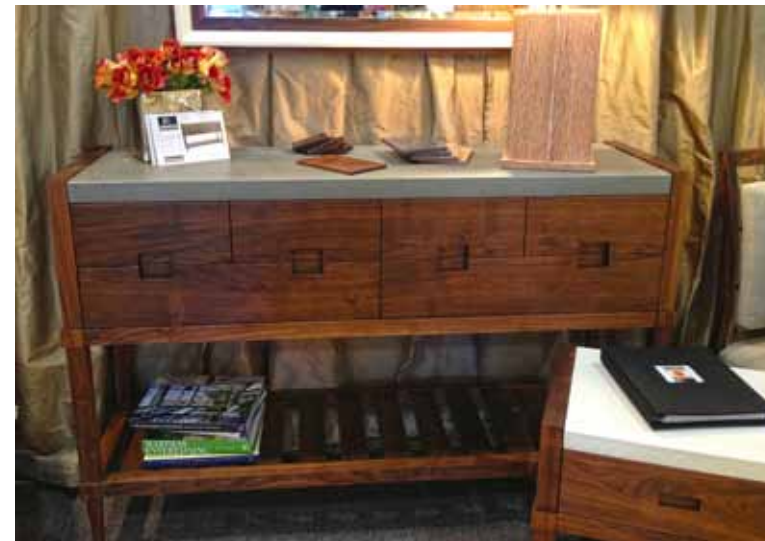
Console table by Black Wolf Design.