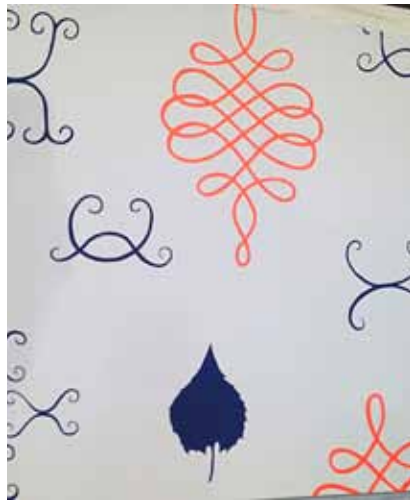
Eclectic wallpaper by Juju Papers.