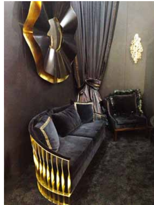
With black and gold as the main color schemes, the Koket booth emanated sultry sophistication.