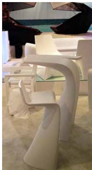
Seating by Vondom.