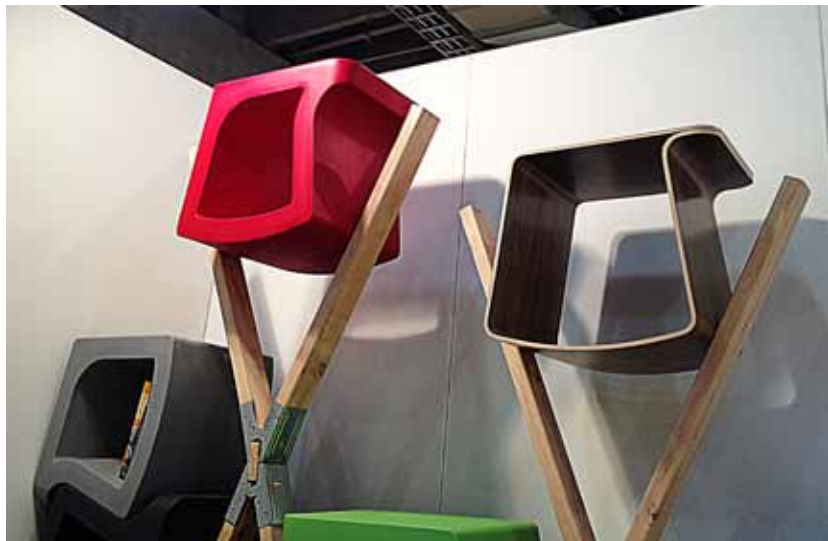
Interestingly shaped stools.