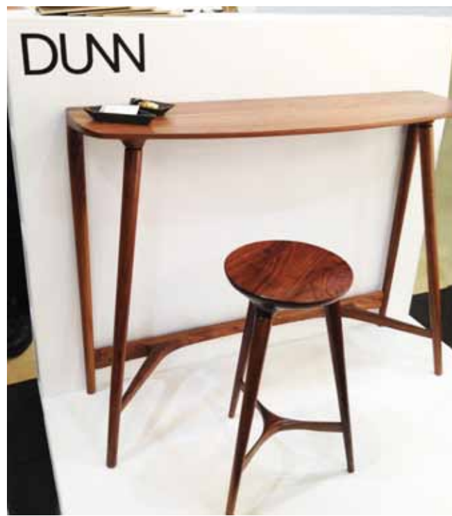
Console table and stool from Dunn.