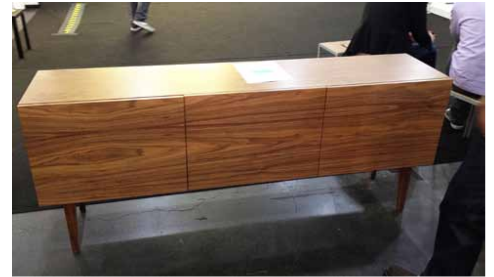
Credenza, part of the well-priced furniture line at Absolutely Home Interior.