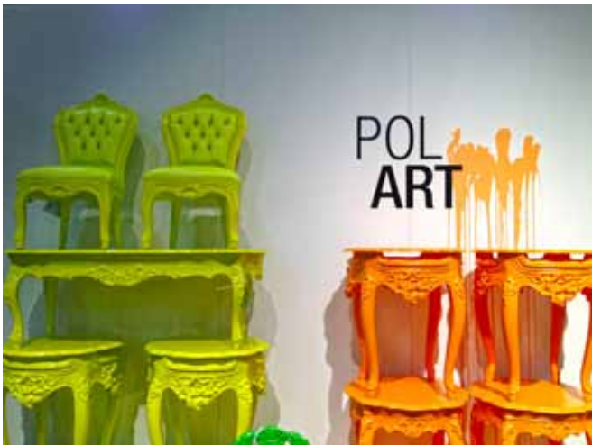
Pol Art's booth brimmed with color. They showed Victorian style furniture with a modern—neon—twist.