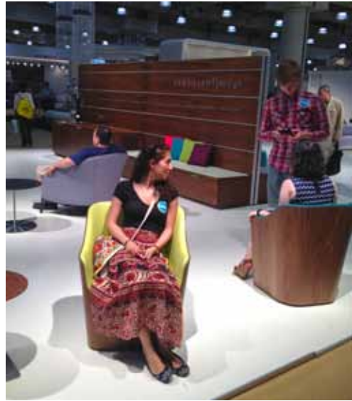
Bernhardt's swivel chairs combined mid-century sleek aesthetic with splashes of color.