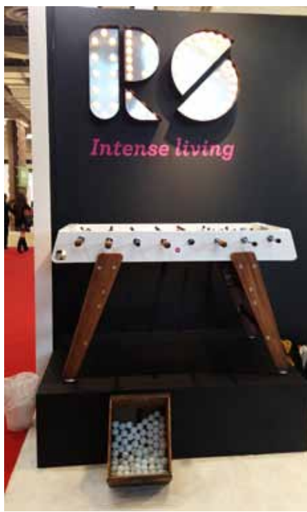
The future of office design? A high-tech foosball table from RS Barcelona.