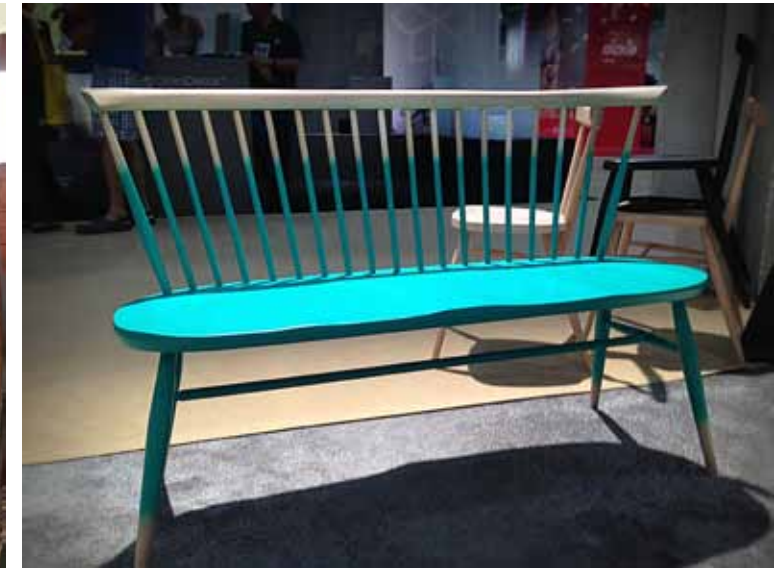
Ombre colored bench at Ercol.