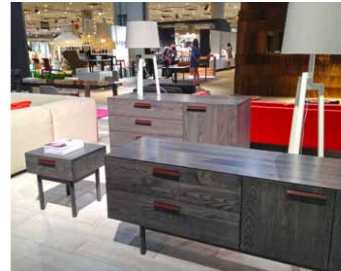
AT Bludot, the new furniture line featured leather handles.