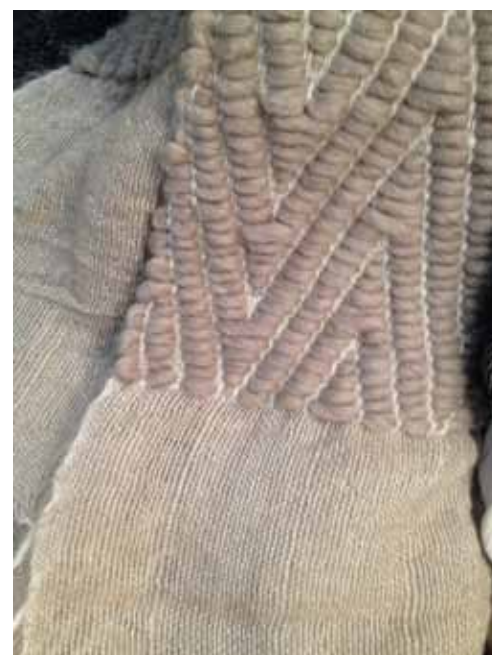
Touchable textures were on display at the Hiroko Takeda Textiles booth.