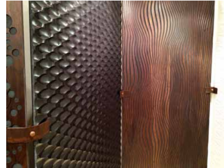
Interior surfaces and commercial wall coverings company Muraspec / Hodjera Architectural showed their wood products, from beautifully textured panels to a take on a hammock.