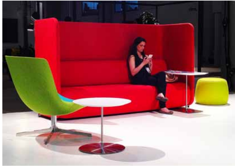
Felt covered furniture at the Bernhardt booth.