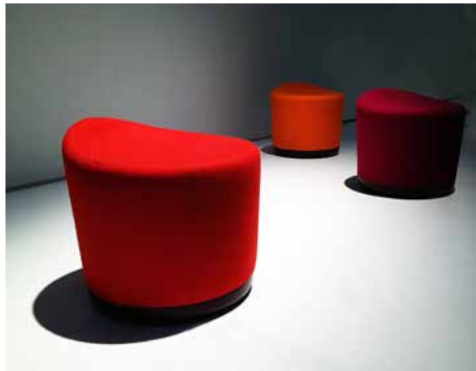
Mod inspired stools by Yeji Kim.