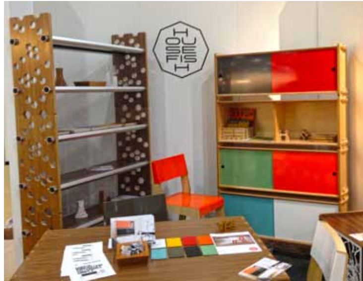
Colorful, well priced office furniture (different color options can be seen in the swatches on the table) at Housefish. Bottom center, the Lock Chair is wrapped in copper.