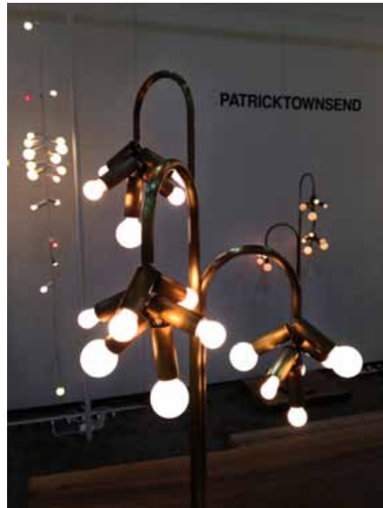
Patrick Townsend light fixture.